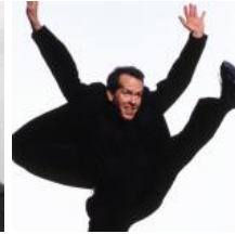
The baker's dozen folks who have Rahm Emanuel's ear on culture in Chicago