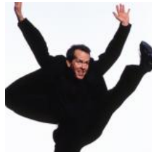
The baker's dozen folks who have Rahm Emanuel's ear on culture in Chicago