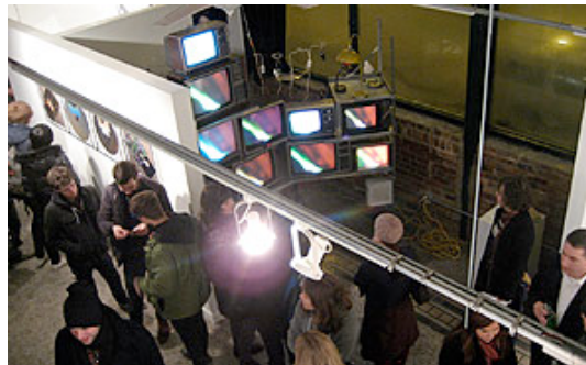
Best Gallery, Reader's Choice : Roots & Culture